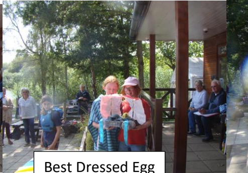
Best Dressed Egg